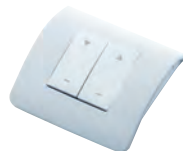
Mouse Wall or Desk 1/2/4/42 Channel Black & White