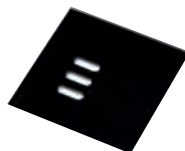
Intense Glass Flush Plate 1/2/3/4/6/7 channel Black & White