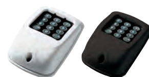
TVTXK868 Keypad 1/2 Channel Black & White Tough Polycarbonate