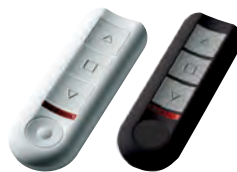
TVTXQ868A03 3/6/18 Channel Black & White Large Buttons