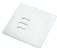
Intense Wall Switch 1/2/3/4/6/7 Channel Black & White Polycarbonate