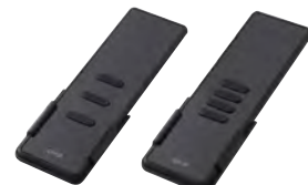
EVO 868 2/3/4/6/18 Channel Black